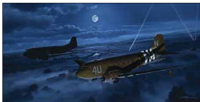
Fig 4. "Green Light, Jump". Oil on canvas, 1994, 18" x 36". by Craig Koder (1956-). This painting depicts the arrival of C-47s into German-occupied France in June 1944.

Bon. By December 1943, one C-47 was being produced in the United States every thirty minutes 12 (Fig. 4).